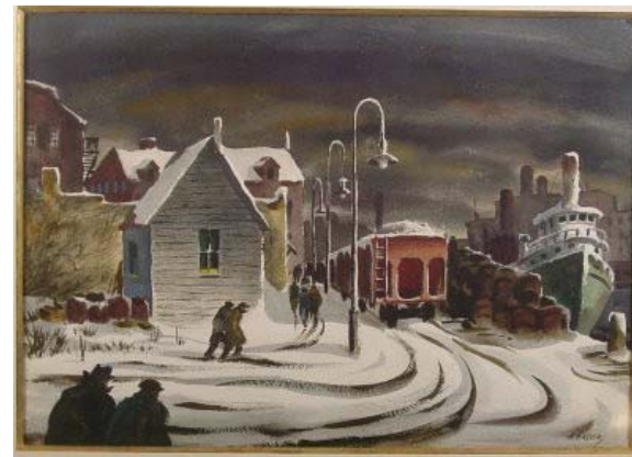
Waterfront, circa 1940

April 1- June 28, 2004 Reception Wednesday, April 14 th 5-8pm